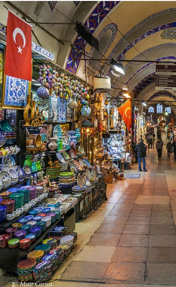
2- Mısır Çarşısı

On the banks of Bosphorus, you may find many good restaurants and nightclubs which lead the city's nightlife. And on a Sunday morning, you can see the Turkish jet-set having their breakfast in a café in Bebek, jogging or swinging their kids in the playpen.